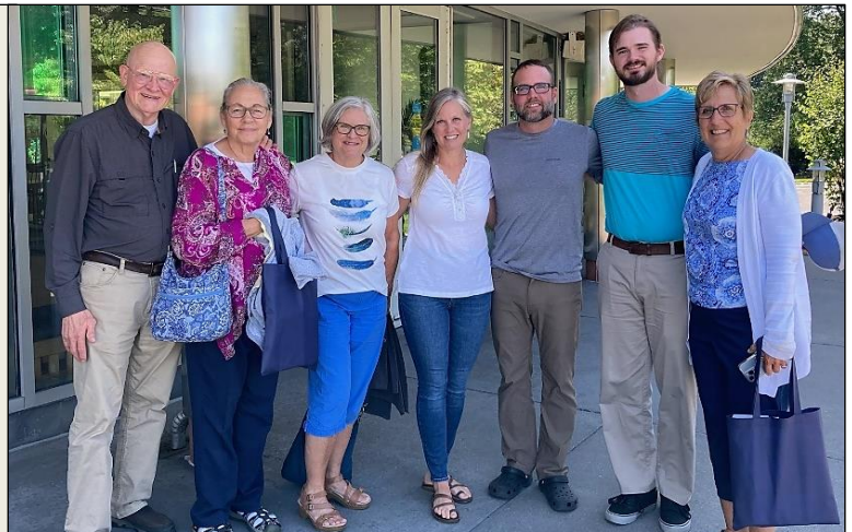
Members of St. Peter's Parish at the ChristLife Conference in Severna Park, Maryland on August 17-19 at St. John the Evangelist Church.