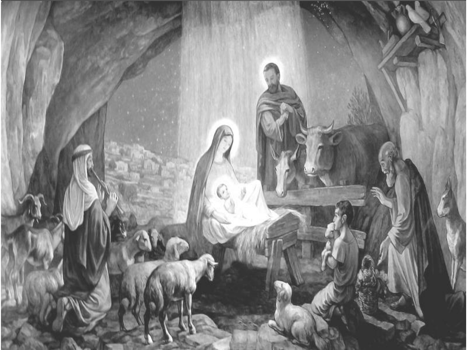
The Nativity of the Lord December 25, 2022

Bread of Life MIGHTY GOD Emmanuel Lamb of God Prince of Peace Glory to God in the Highest. Light of the World Savior Wonderful The Truth Christ the Lord