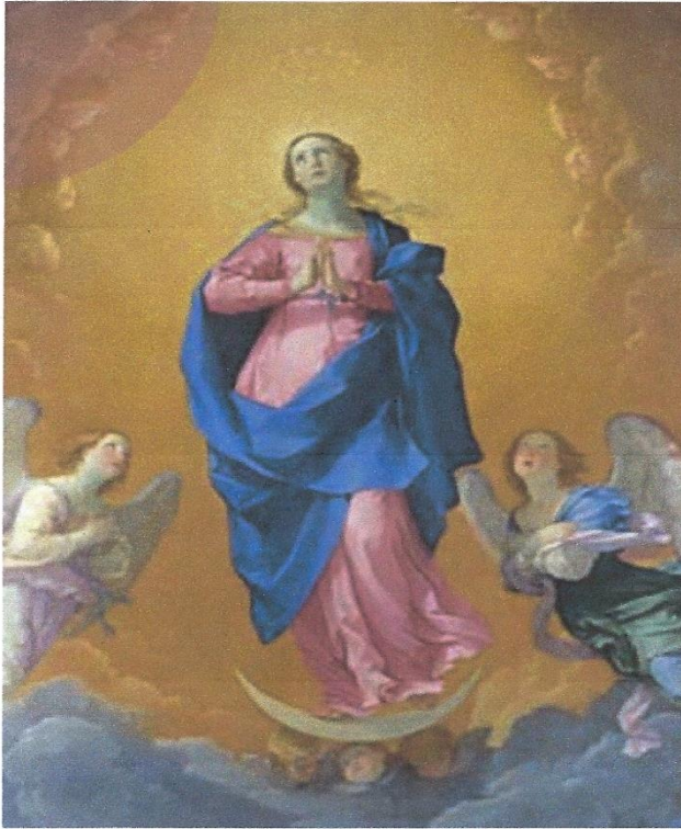
The Immaculate Conception, 1627, Artist: Guido Reni Italian, Met Museum Collection.