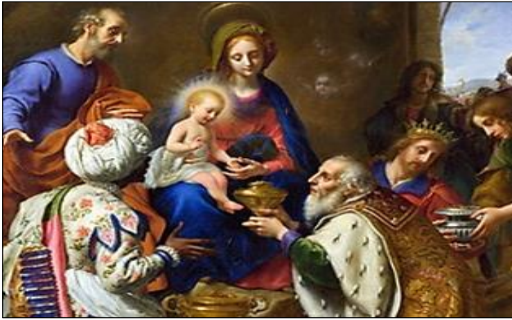
The Epiphany of the Lord January 7, 2024

47 Central Avenue, Wellsboro, Pennsylvania 16901 Rectory Phone: 570-724-3371 ~ Fax: 570-724-6322 Religious Education Office: 570-724-9789 Website: www.stpeterswellsboro.com