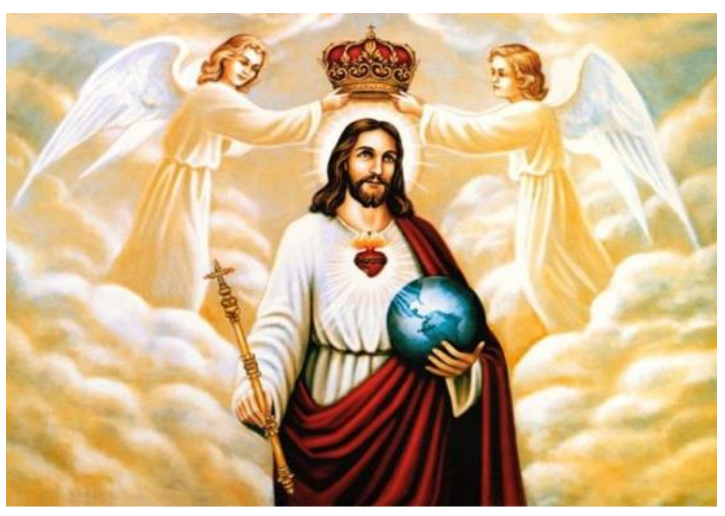
Our Lord Jesus Christ, King of the Universe November 20, 2022